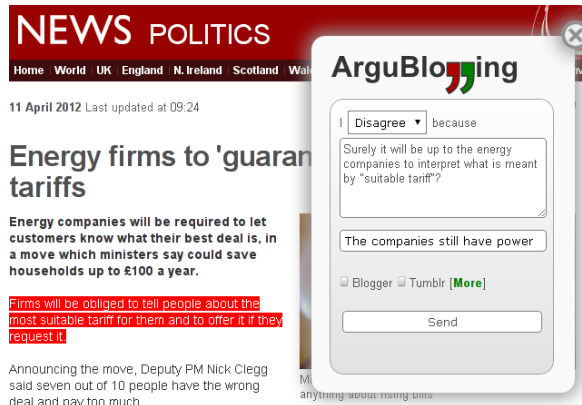
Figure 1. ArguBlogging widget rendered on a web page